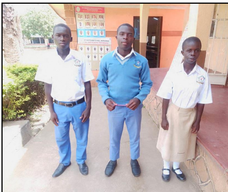
Children at St. Kizito High School pose for a photo during the visit at the school

Children at St. Kizito High School were visited during the month. The Headmaster was consulted on how children were faring at school. This was done with regard to behavior and academics as well. The Headmaster reported that the children were gradually improving in academics and that they were well behaved at school. This gives an insight that these children will be able to excel in their studies. Children were also urged to continue behaving well and to also put in more effort as they study since this will help them excel in their studies.