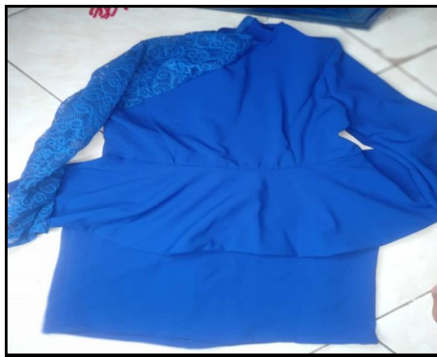
A party dress